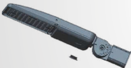
Optional daylight and motion sensor on the bottom