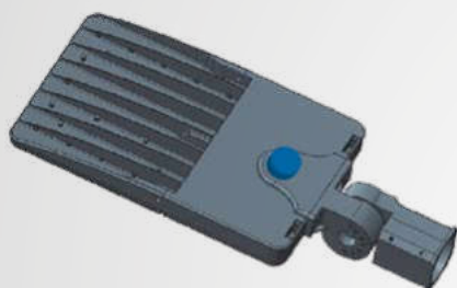
Optional daylight sensor (on top)