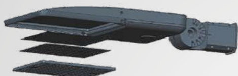
Optional overvoltage (lightning) protection

Available with daylight detector and motion detector